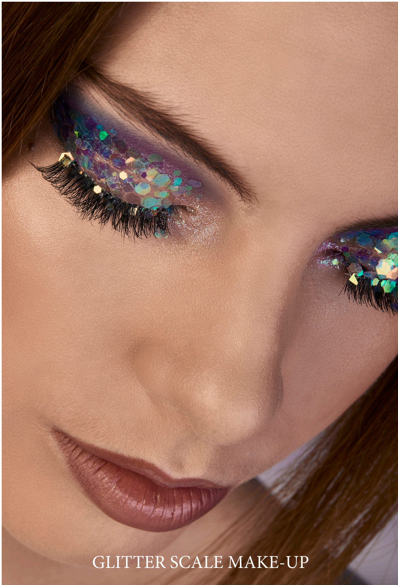
GLITTER SCALE MAKE-UP