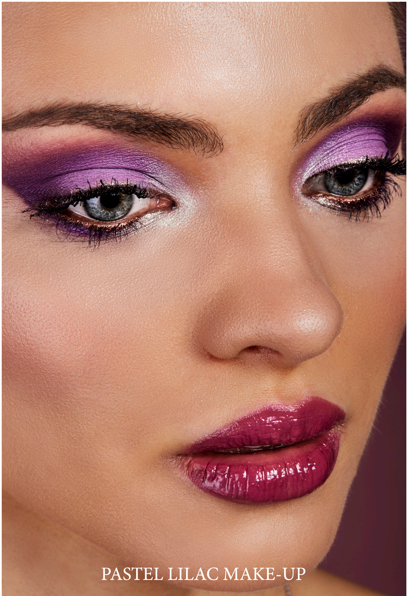
PASTEL LILAC MAKE-UP