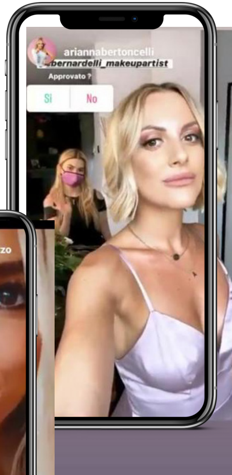
ariannabertoncelli 237k followers