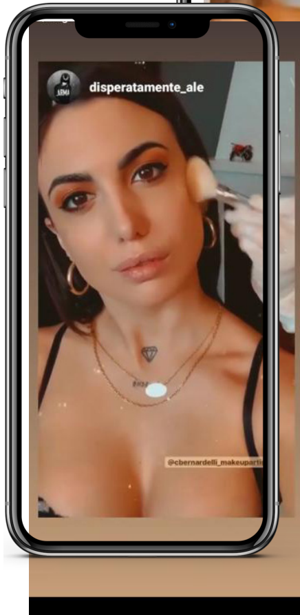
disperatamente_ale 251k followers