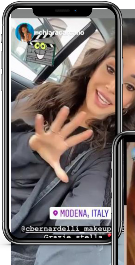
chiaracarcano 435k followers